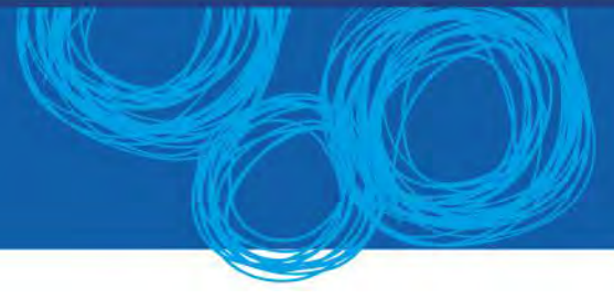
Crestmead State School – Year 5 NAPLAN